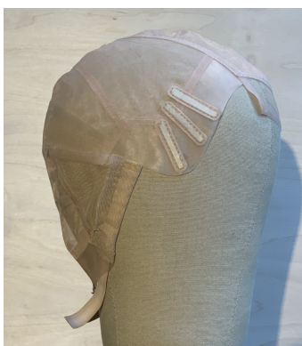
Cheveux™ Full Base

Each color design features a hand-painted, natural shadow root, providing a beautiful backdrop to showcase the color dimension and value range of our hand-blended Parisian Color Palette.